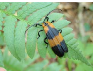
Search for signs of invertebrates at Arcadia Wildlife Sanctuary during this special Program.