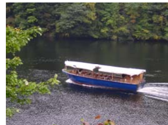
Cruising on the QII