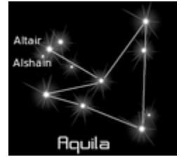
Altair, one of 3 brightest stars of the summer triangle is said to be the head of Aquila the Eagle.

Sat., August 20; 6– 7:30 p.m. For ages 7 and older Fee: FREE Register by calling 800-859-2960