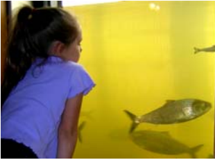
A young shad fan