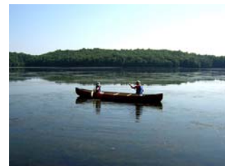
Canoeing Barton Cove

With 2 day canoe rental...$90 With your own canoe .....$30