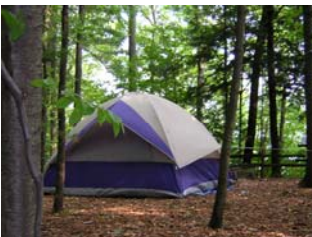
Limited car access makes Barton Cove a delightfully quiet camping area.

Campers may access the campground by boat only. Reservations are required. Camping is limited to two nights (except for three day holiday weekends). The boat dock will not be installed before June 15. Tent sites are $22 per night and the Adirondack shelter is $30 per night. Munns is open from Memorial Day weekend to Columbus Day. Potable water is not available on site.