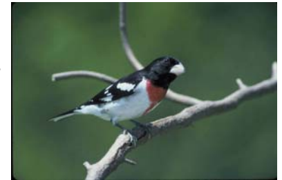
Rose-breasted Grosbeak

Life Science (Grades 1-2) #1,#3,#6,#7,#8, (Grades 3-5) #2,#3