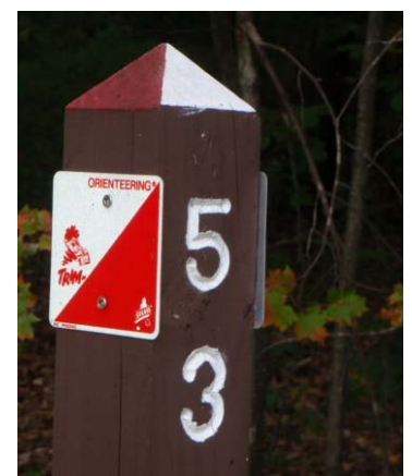
Orienteers search for “control point” posts hidden in Northfield’s woods & fields.

We will continue to support teachers interested in leading their own orienteering program. An instructional activity packet designed to help teach map reading and orienteering skills at your school is available for $6.00 (plus $3.85 postage & handling.)