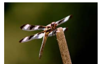
Twelve Spotted Skimmer

Both programs meet at Arcadia Wildlife Sanctuary in Easthampton