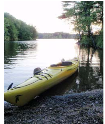
Enjoy a peaceful evening kayaking the cove.