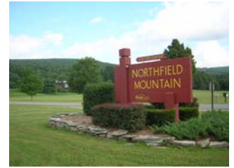
Many programs meet at the Northfield Mountain Visitor Center