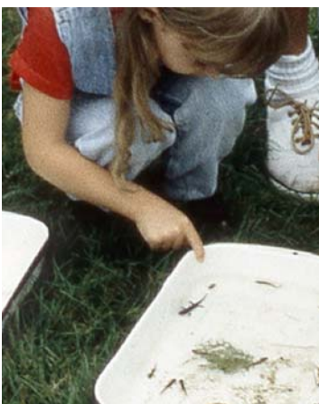
Look! A salamander!

Life Sciences (Grades 1-2) #1, #3, #6, #8, (Grades 3-5) #3, #4