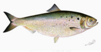
American shad by Sherman Denton, 1904

Visit the Turners Falls Fishway for a watchable wildlife experience. This program focuses on migratory fish of the Connecticut River and the fish ladders that help these fish bypass the dam. A variety of activities will introduce anadromous fish and the challenges of their upstream journey. These fascinating fish are born in the river or its tributaries, migrate to the ocean and return as adults to spawn in freshwater. American Shad