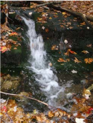
Cascading brook along Rose Ledge trail