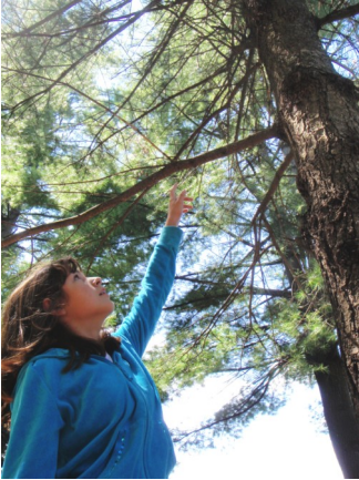
Experience the wonders of nature on a fun field trip.

Please join us this fall for one of the many field trip opportunities offered for schools and organized groups. Our goal is to provide quality learning experiences that are both educational and engaging, using the outdoors as the classroom. Please note that our fee waiver policy sets aside limited funds for individual students.