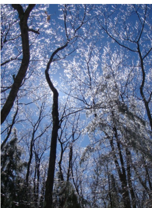
Trees stand leafless in December.

Northfield Mountain 99 Millers Falls Rd. Northfield, MA 01360