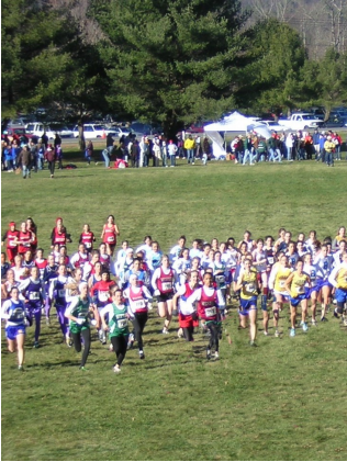
On your mark, get set, go!

Come watch the top teams from Western Massachusetts high schools compete for a place at the State Cross Country Championships. This event includes the