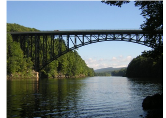
The Riverboat passes under the scenic French King Bridge

Fee: $6/student. One free adult chaperon for every 10 students.