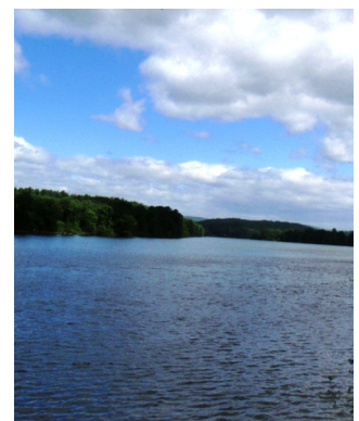
Relax along the Connecticut River during a mid-day picnic.

Looking for a beautiful picnic area on the banks of the Connecticut River? Why not try Unity Park next to the Fishway in Turners Falls, Barton Cove Campground off Route 2 in Gill, or Riverview Picnic Area near the Northfield Mountain Visitor Center? All have picnic tables and charcoal hibachis open on a first come, first served basis. Areas are open free of charge and remain open until dusk.