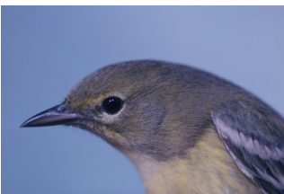
Pine Warbler

What is happening in the animal world during the fall? From insects underfoot to birds overhead, there's activity everywhere as animals prepare for winter. This outdoor program is filled with activities and games that help children discover for themselves what is happening during this special time of year. The focus is on observation skills as stu-