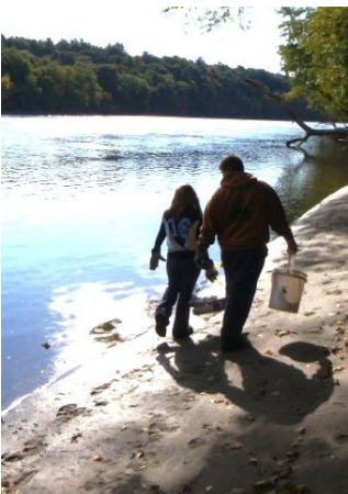
Franklin County Technical School Students help in clean up efforts.

Meets at Great Falls Discovery Center, Turners Falls, MA.