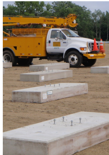
Boom truck installing solar panel bases.

The Northfield Solar Project will produce Massachusetts Solar Renewable Energy Credits which must be purchased by utilities and other organizations to help them comply with the RPS or other business objectives. A Solar Renewable Energy Credit (SREC) represents 1