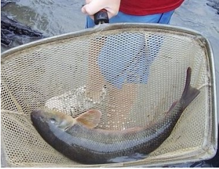
Get up and close with fish of the Connecticut River.