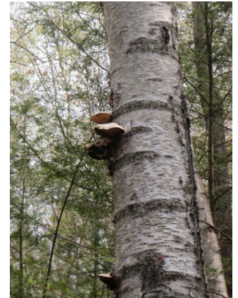
Shelf mushrooms adorn a tree deep in the woods.

#4 #5 Life Science (Grades 4-5) #1 #3 #8 #9